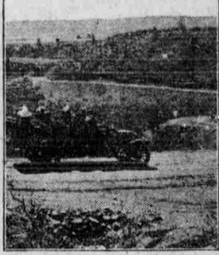
'Devil's Sickle," on the Colorado Springs-Canon City State Highway.