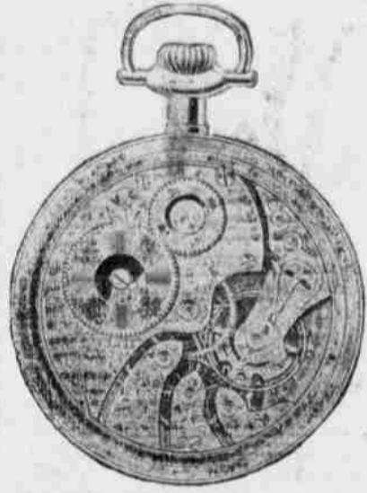
THE South Bend WATCH

Join Dixon's South Bend Watch Club And Buy on Easy Terms for Less Money An easy convenient plan of buying a Good Watch