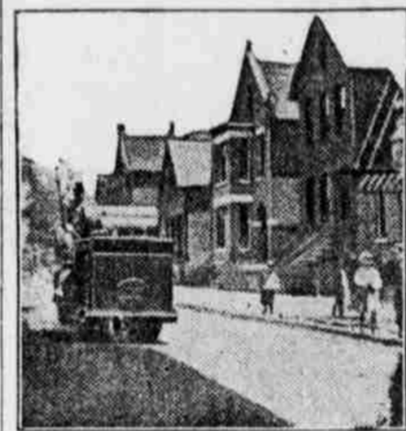
Five-Ton Tandem Road Roller in Action.

The chief drawback from the farm owner's point of view is that the laying out of road on this principle of avoiding grades necessitates in some cases running the road through good farm land or orchards of pastures instead of going around the farm line and building the road through old worn out fields and over rocky knolls. This of course must raise a question in the mind of the individual landowner as to whether the cutting up of his property by a road yields him individual advantages and so benefits his community as to offset the use of such land for a road or to overcome the inconvenience of having his land divided. In this connection the office of roads points out that the running of a road and the resulting traffic through a good farm where there are good cattle, horses, sheep, grain, fruit or vegetables has a certain advertising value and in many instances makes the land more valuable. In other cases the importance of such a