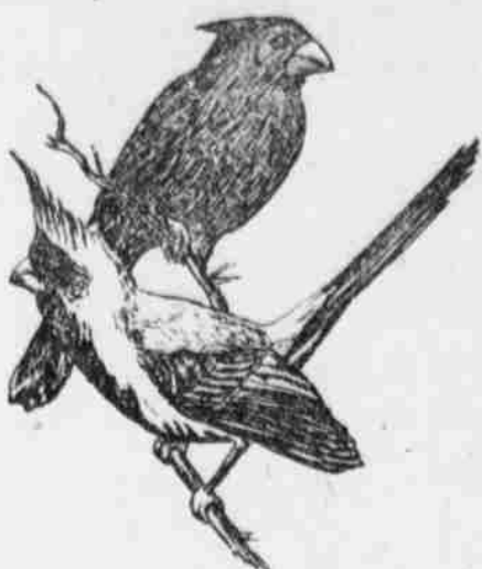
Cardinal and Gray Grosbeaks.