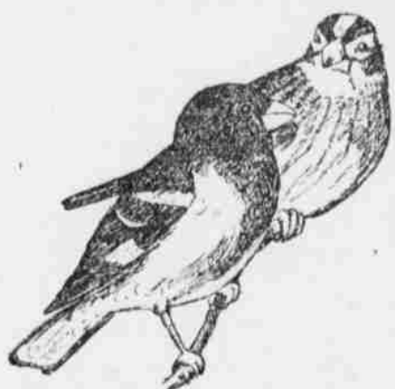
Black-Headed and Rose-Breasted Grosbeaks.

The rose-breasted grosbeak, potato-bug-bird, has an extensive range, breeding from Kansas and the mountains of Tennessee north to Canada and north and east to the Atlantic ocean and Newfoundland. The rose-breasted has long been held in high esteem because of its habit of preying upon the potato beetle, and the name potato-bug bird suggests its important services in this direction. Larvae, as well as adult beetles, are consumed, and a great many are fed to nestlings. No less than a tenth of