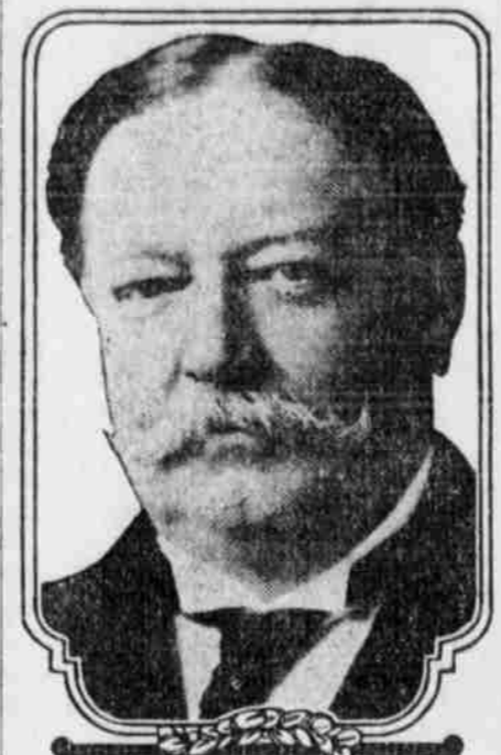
WILLIAM H. TAFT

Conceding that the scientific eugenists have established their contention—that the human race is rapidly de-