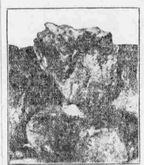
Carnotite Ore From Which Radium Is Taken.

"And on the following day, or within 48 hours after the radium was ap-