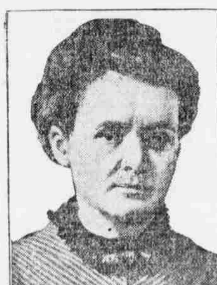
Mme, Curie, Discoverer of Radium.

Radium will cure some types of cancer absolutely. It may cure all.