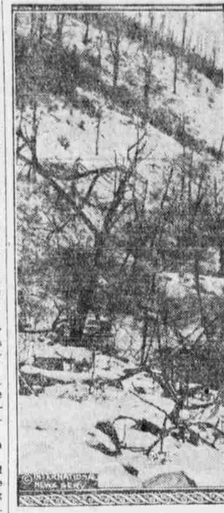
Mountain Scene Near Mauch Chunk, Pa., Where Radium Deposits Have Been Found.

"It appears to have been established that radium, when applied in time, is a cure for superficial cancer and some of the highest authorities advise that there is no reason to doubt the effectiveness of radium as a cure for in-