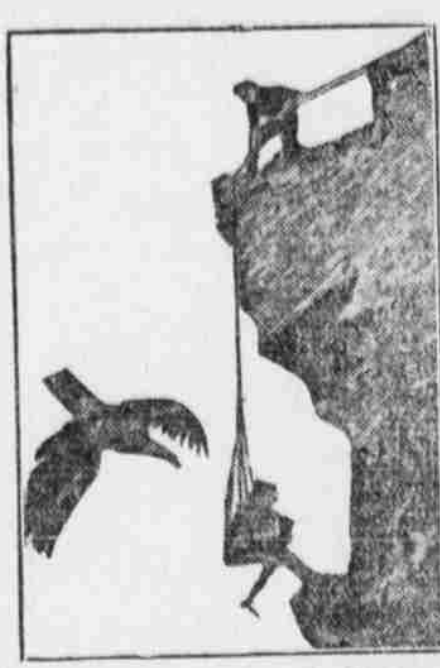
"Snapping" a Condor's Nest.

He cites one case in particular in which he had lain in wait for a week with his imitation camera going full speed, grabbing a meal when he could, only to have the bird take fright and leave her nest forever, thus wasting all his time. He has, however, been