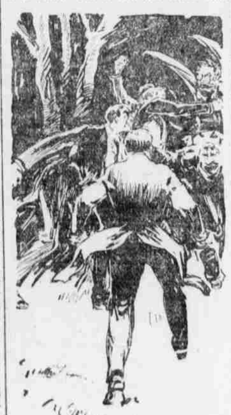
He Struck Lightning Blows as an Eagle Strikes.

uttered it, but some woman who stood stood alone before the advancing one, seemed to be falling upon a stone ball past the larger one so closely that every eye following, every ear alert | With an inarticulate cry he inunched wall