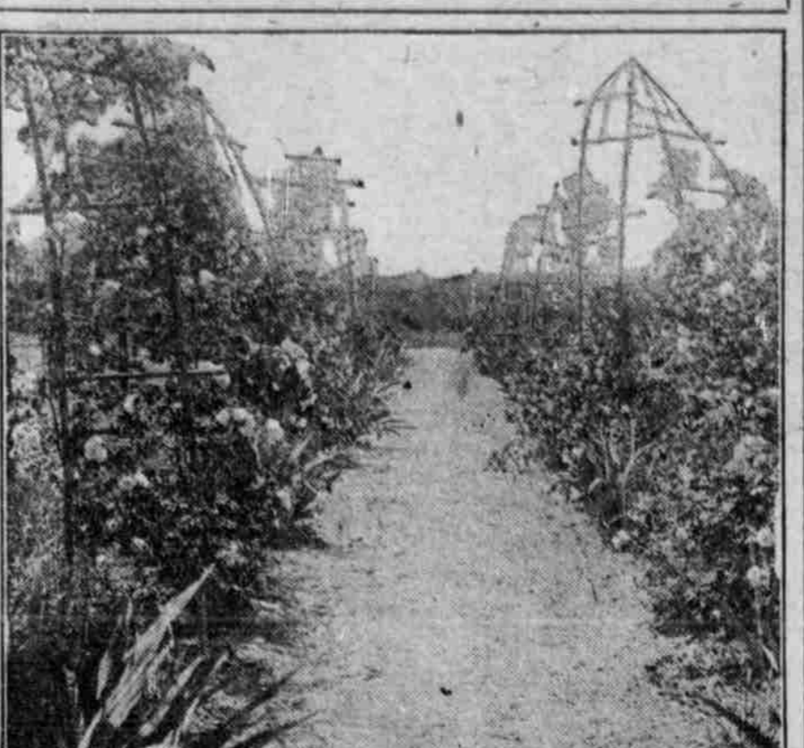
Bamboo Poles Are Used to Form This Rose Trellis, Making an Effective and Unusual Support.