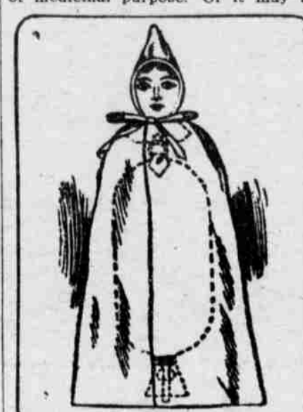
Water Bottle Baby.