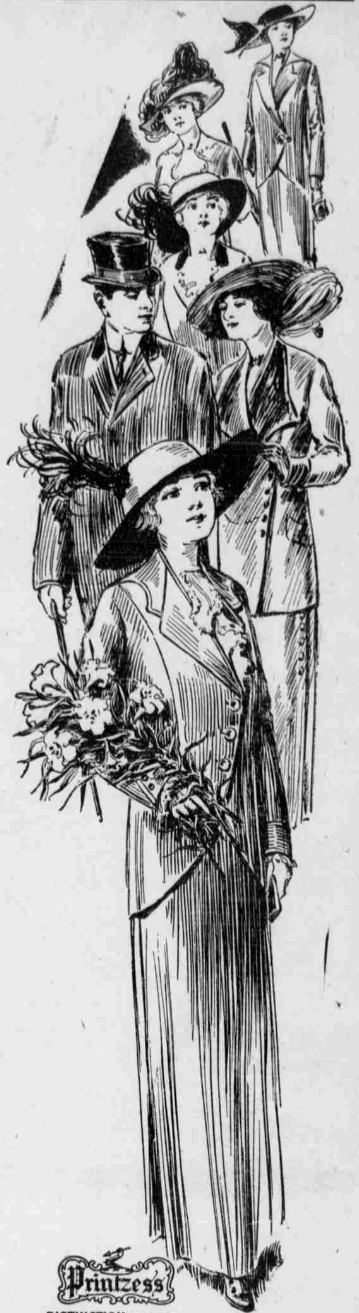
Princess DISTINCTION IN DRESS

Do not fail to secure a Princess garment