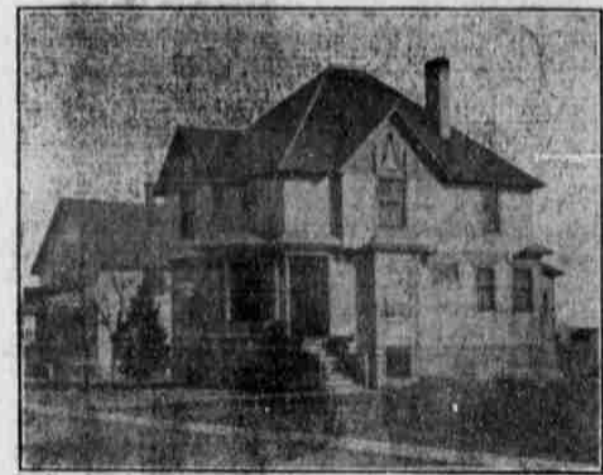
View Adjoining Our Ten Acre Tracts

Just south. Price $1,500 per tract, one-half down, balance at six per cent.