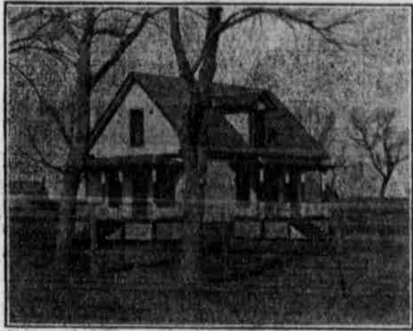
This beautiful property on W. 4th Street. 8 rooms, bath and hot water heat. A chance of a life time to buy a beautiful home at one-third less than it cost. Price $4,800.

The property illustrated below is one of the finest homes in the east end. Eight rooms, bath, heat, electric lights, walks around house. Nice lawn and trees. Price $3,300