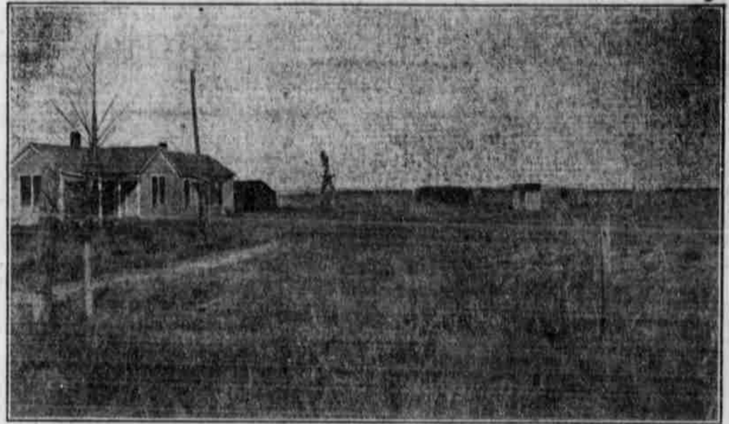
View Adjoining Our Ten Acre Tracts

6 room house on South Sycamore. Electric lights. Good out buildings, chicken house chicken yard. Nice yard and shade trees. Price $2,600