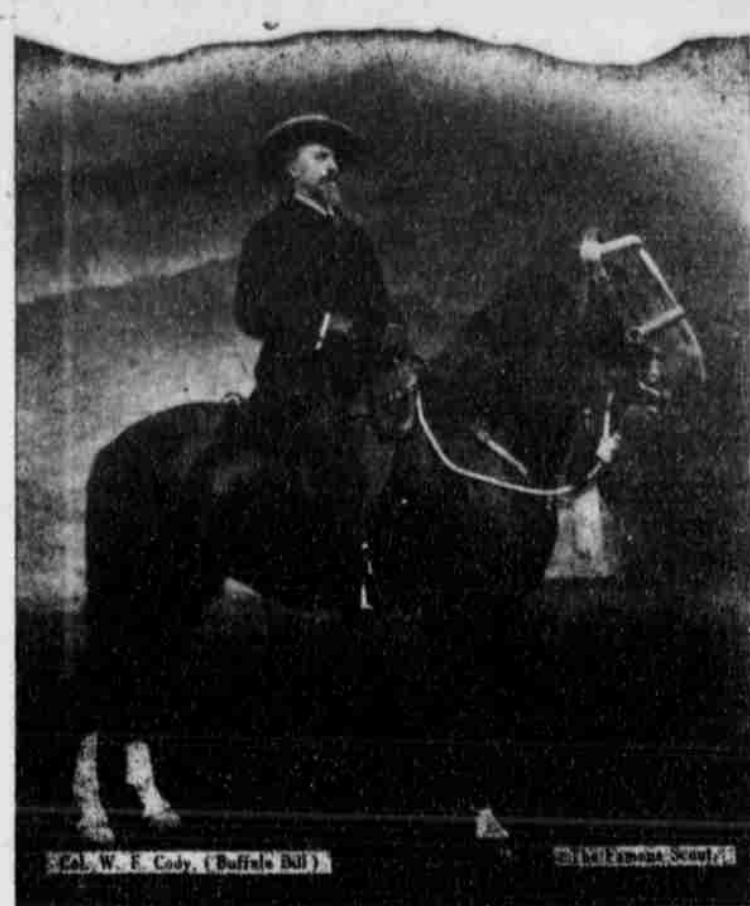
North Platte's Best Known Citizen—"Buffalo Bill"

The Union Pacific uses this ice for its icing plant, the largest in the world.