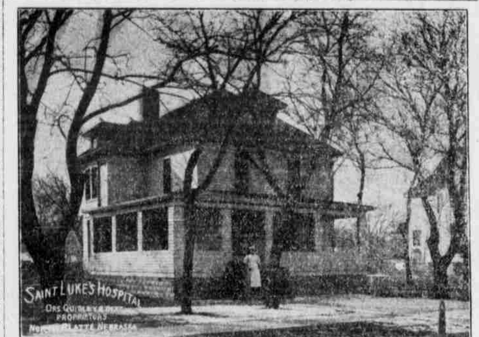
ST. LUKE'S HOSPITAL.