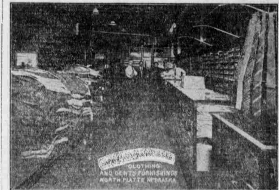
Interior view of the Star Clothing House.

He is entitled to a high place among the boosters and pushers for North Platte and Lincoln county.