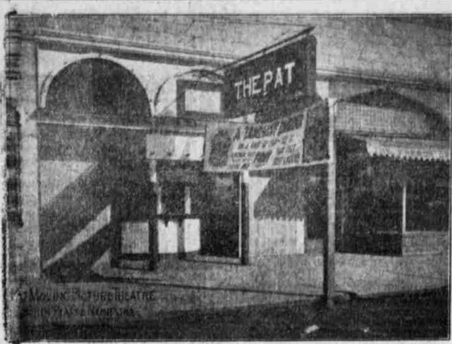
THE PAT THEATRE - The Home of Good Pictures.