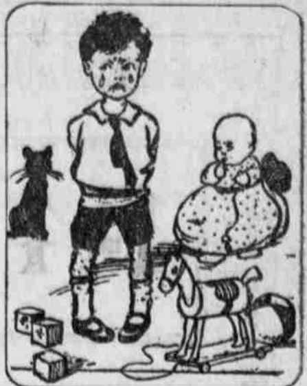
Cross-Patch got up one day. Wouldn't smile, wouldn't play. Snatched his toys from baby brother. Smacked the cat and grieved his mother. All because—or so 'tis said—He got the wrong way out of bed.