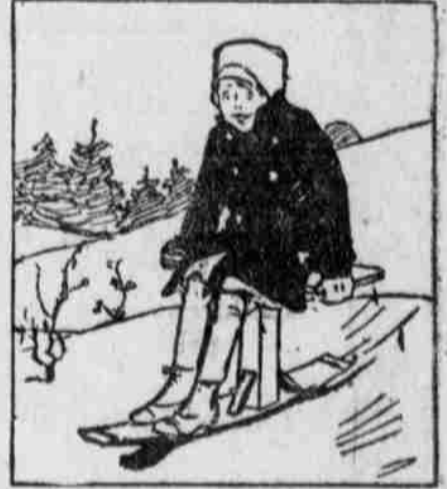
Skipjack for Coasting.

The boy who is handy with tools and fond of possessing an article of amusement quite out of the ordinary will enjoy making a "skipjack." The skipjack is very easily made and it furnishes no end of fun to those who