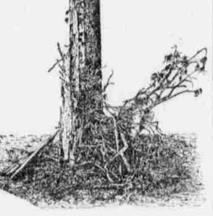
Yellow Pine, Arizona, Completely Shattered by Lightning.

show that conifers rank third in liability to stroke. The persistent popular belief regarding immunity of some trees and liability of others have given rise to the following theories regarding trees most likely to be struck: 1. Tall trees: Because they reach high toward the electrically charged cloud, and therefore lessen the distance with the flash must traverse through the dielectric (air). Such trees are conceived to be a part of the earth, extending upward and inviting the stroke. 2. Trees with pointed crowns: Because they invite, to their one apex, a single full-pressure flash. Trees with rounded crowns, favor the diffusion of the flash into a spray. 3. Trees with pointed leaves: Because static electricity jumps most easily to and from pointed terminals. 4. Trees with smooth or shiny leaves: Because a smooth surface invites flashes, while a hairy or woolly surface, presenting a multitude of fine points, favors diffusion. 5. Trees with deeply grooved bark: Because bark deeply grooved longitudinally guides the current to the ground, and because the moist sapwood is close to the surface in the bottoms of the fissures. 6. Trees isolated: Because they are the only marks for the flash and are conductors. 7. Trees on high ground: Because