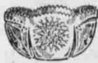
Sparkling Cut Glass

We have an extra fine line of detachable handle umbrellas for Christmas and so many other appropriate articles for gifts that we can't mention them all. Give us a little of your time when down town.