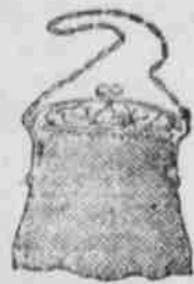
Silver Mesh Bags.