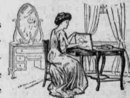
Dresser and Dressing ing Tables $9 and Up.

American people like beautiful things, but they also like things that are practical, and furniture furnishes the thoughtful buyer an opportunity to get just the serviceable kind of presents that will please the most. This store is showing a large line of furniture. Gifts that will be warmly received.