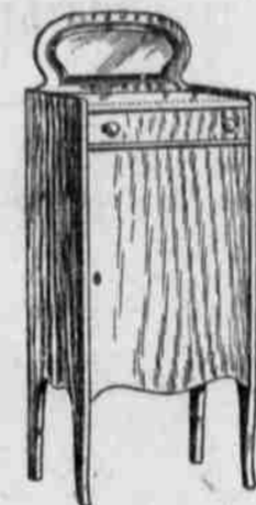
Music Cabinet Quartered Oak and Mahogany, $10.50 and up

Gifts today must be gifts that endure—gifts that are serviceable as well as beautiful and attractive—and donors are making just such presents. Furniture is popular for Christmas giving for the reason that it goes into the home to stay and is appreciated, not simply for the moment but for years and always stands as a reminder of the donor.