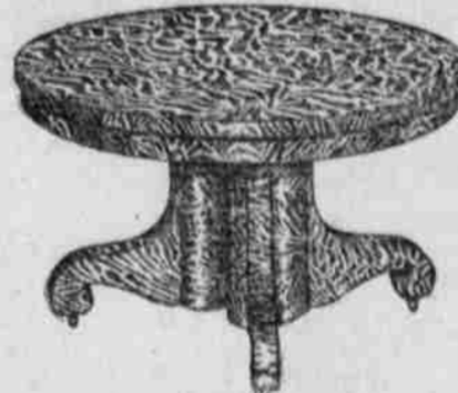
Cadillac Desk $15.00 and Up.