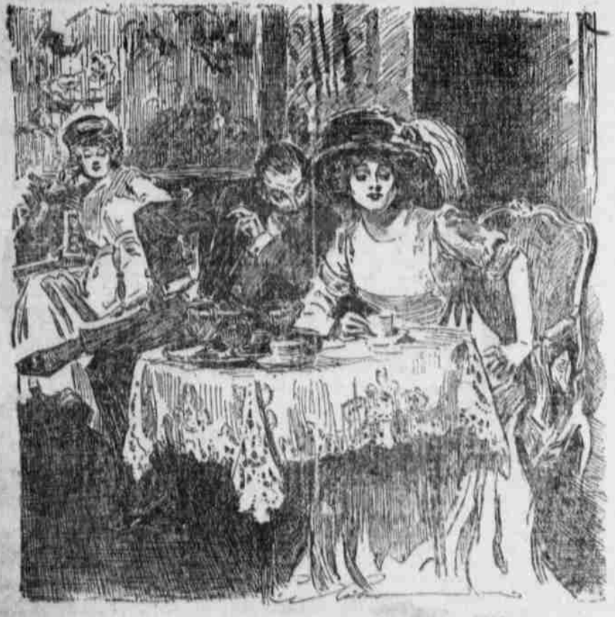
"I shall have need of friends," she said half to herself.