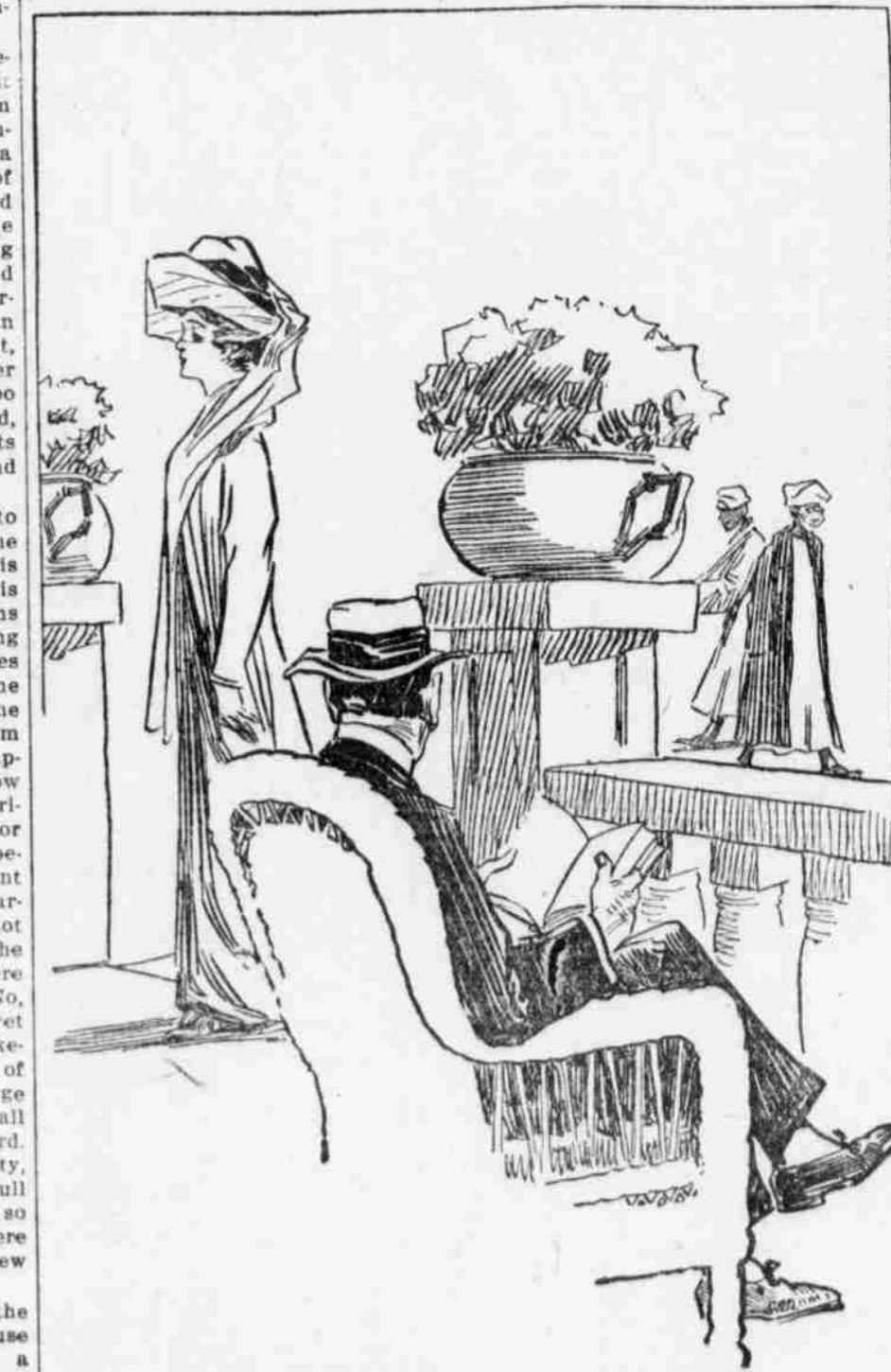
This Girl Was Elegant, in Dress, in Movement.

izing his father. He wrote himself down as George Percival Algernon Jones, promised to become a linguist and to learn the rug business from the cellar up. On the face of it, it looked like a big job; it all depended upon the boy. The first day at school his misery began. He had signed himself as George P. A. Jones, no small diplomacy for a lad; but the two initials, standing up like dismantled pines to the midst of uninteresting landscape, roused the curiosity of his school-mates. Boys are boys the world over, and possess a finesse in cruelty that only Indians can match; and it did not take them long to unearth the fatal secret. For three years he was