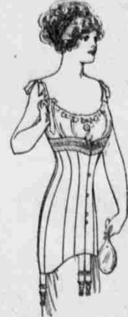
HENDERSON Fashion Form Corsets

An exceedingly shapely, well made corset for the average figures. This model is the very latest fashion. Bust is medium high. Attractively trimmed. Deep skirt extension. Reinforced front clasps. Non-rustable double boned throughout. Three pairs very serviceable supporters. All sizes. PRICE $2.00.