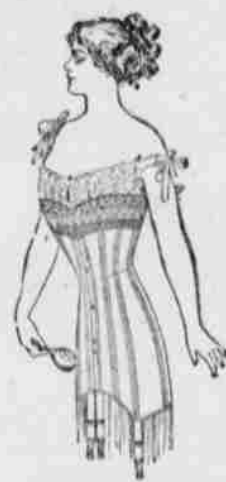
HENDERSON Fashion Form Corsets

A very desirable attractively designed corset for the average figure. High bust. Deep skirt extension. Two pair supporters. Made of good quality Coutil. An exceptional value. PRICE $1.00.