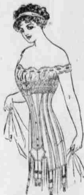
HENDERSON Fashion Form Corsets

An exceedingly shapely, well made corset for the average figures. This model is the very latest fashion. Bust is medium high. Attractively trimmed. Deep skirt extension. Reinforced front clasps. Non-rustable double boned throughout. Three pairs very serviceable supporters. All sizes. PRICE $2.00.