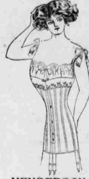
HENDERSON Fashion Form Corsets

A very good style for the average figure. Embroidery trimmed. Non-rustable boning throughout. Front and side supporters made of best quality Coutil. PRICE $1.00.