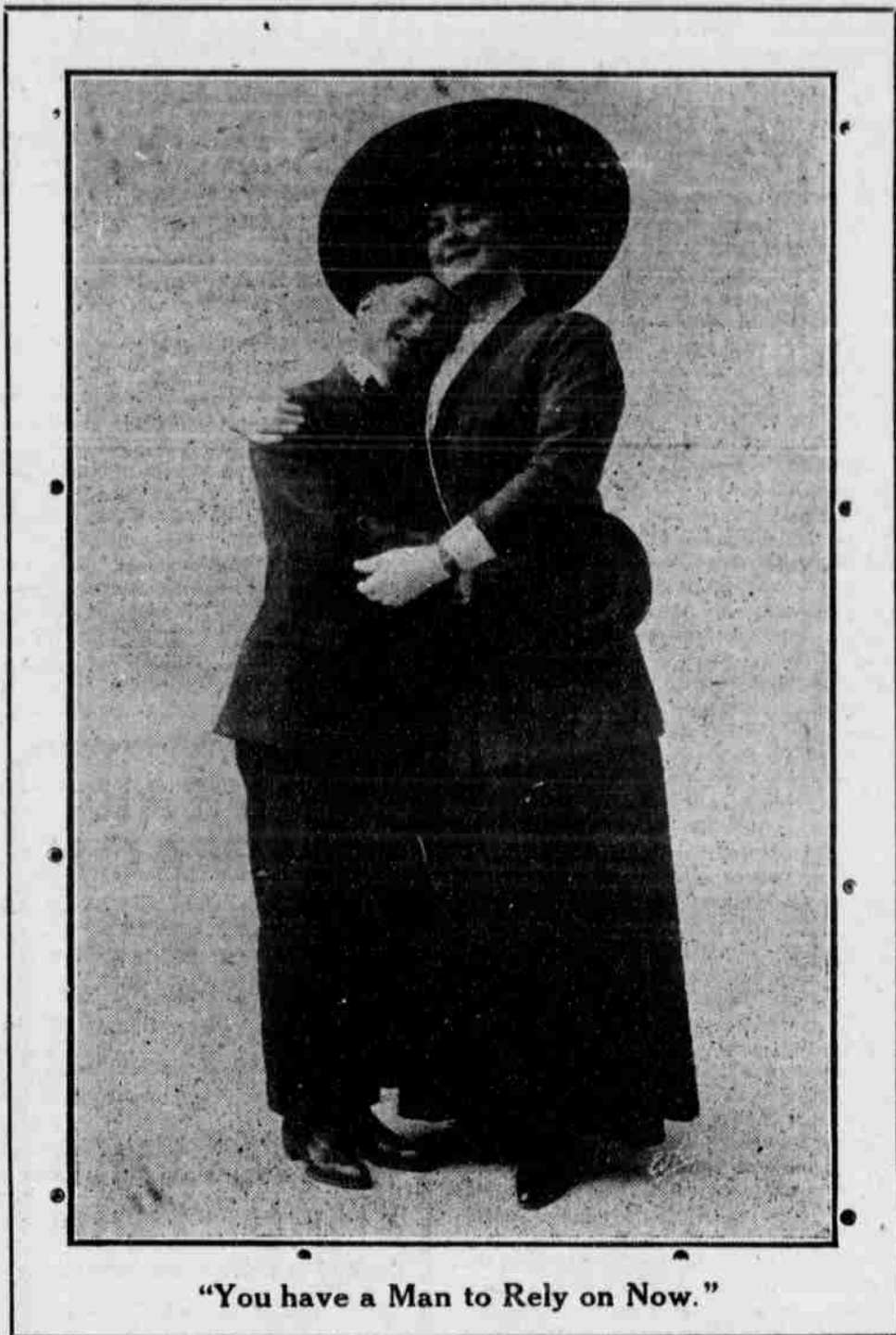
"You have a Man to Rely on Now."

"All the World Loves a Lover," sang the poet. This might be paraphrased to read: "All the World Loves a Laughter." Now is the time to have all the buttons sewed on because