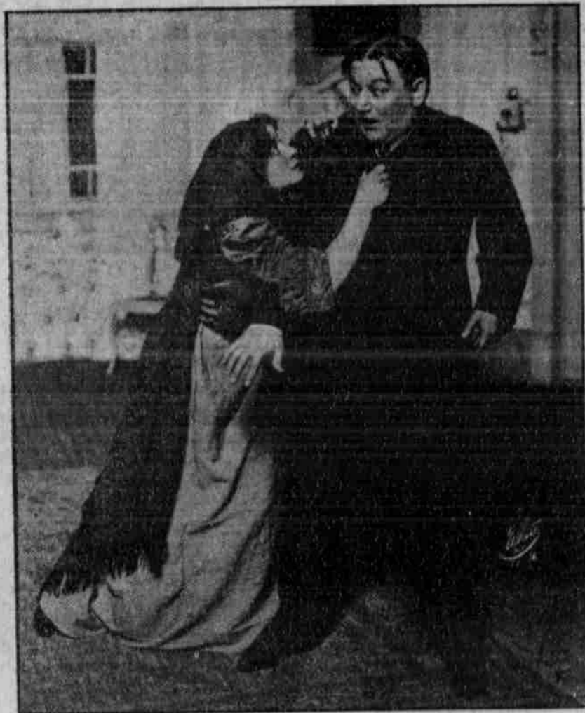
Wm. A. Brady's remarkable success, "By Mine", which comes to the Keith Theatre, on Wednesday Nov. 22nd. Direct from 4 years run at 1015's Theatre New York.