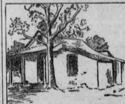
Davy Crockett Home.

In the north part is the Alamo Plaza, with the fort of that name which, 64 years ago, was the scene of a savage and sanguinary encounter between a small company of Texans and Americans, and a greatly superior force of Mexicans, which resulted in the capture of the fort and the mas-