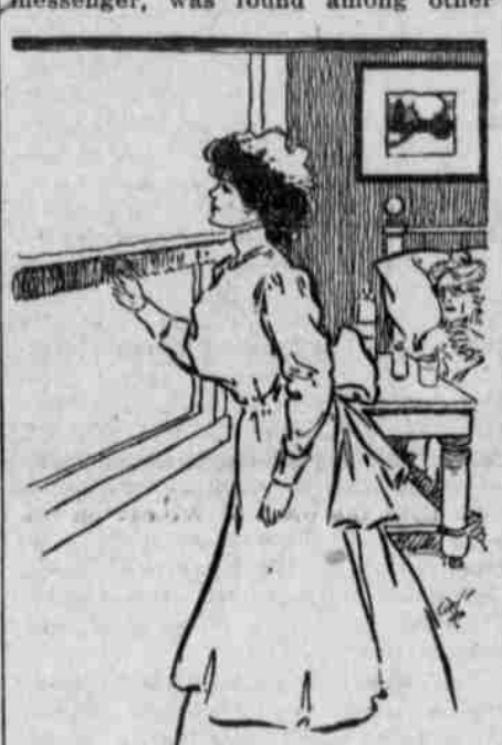
She Swished to the Window and Rais ed the Shade.

This note, evidently delivered by messenger, was found among other