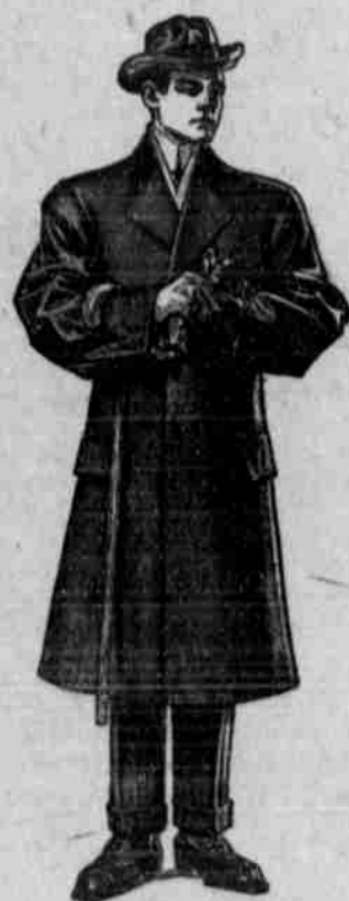
Copyright 1910 The House of Kuppenheimer Chicago

B UY him some thing useful that "he" will appreciate. We've just the sort of things "he" will be so glad you thought of for his Christmas.