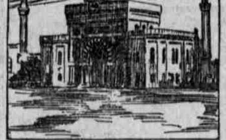
The Imperial Ottoman Bank.

Moreover, the vast majority of the people of the Ottoman empire seem to have become imbued with the conviction that the downfall of Abdul Hamid, the revival of the constitution and the inauguration of forms of