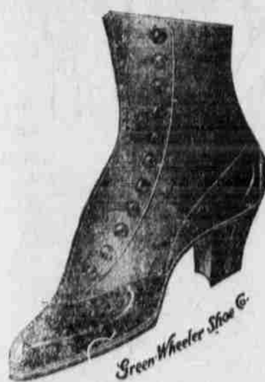
Green Wheeler Shoe Co.

We show a large line of fall and winter shoe styles for men, women and children. All the latest shapes. Every pair of shoes we offer is a splendid value; theres nothing inferior in our stock.