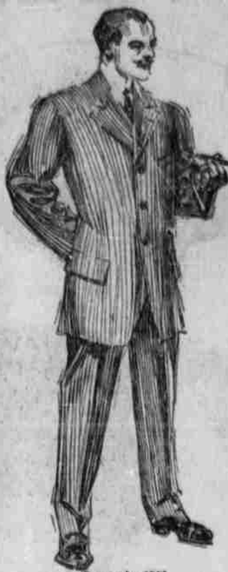
Copyright 1910 The House of Kuppenheimer Chicago