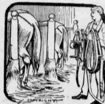
A Man That Keeps Good Horses

don't want to spoil their appearance or risk his own life by harnessing them with an inferior made or shabby harness. It pays to buy a good harness when you do buy, for it always looks well as well as wearing well. For style, durability and make call on