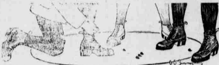
Copyright 1910, by C. E. Zimmerman Co.—No. 15