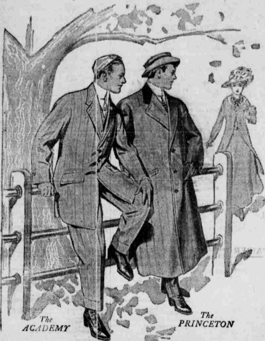
The ACADEMY The PRINCETON Ederheimer, Stein & Co. MAKERS

O UR JANUARY CLEARANCE SALES have long been known as the biggest bargain-giving events in North Platte. Our patrons look forward to it with the same fond expectancy that a child does to Christmas. We make it a point not to disappoint them. We aim to give them big values for their money.