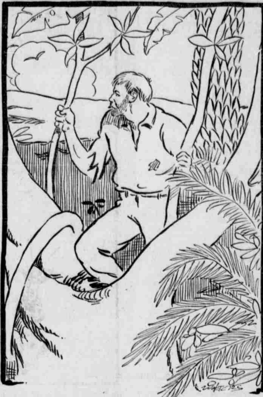
Satisfied Himself That Miss Leslie Was Well Out Toward the Signal.

Blake was under the baobab, raking together a heap of rubbish. His hands were scratched and bleeding. To the girl's surprise, he met her with a cheerful grin and a clear, direct glance. "Look here," he called.