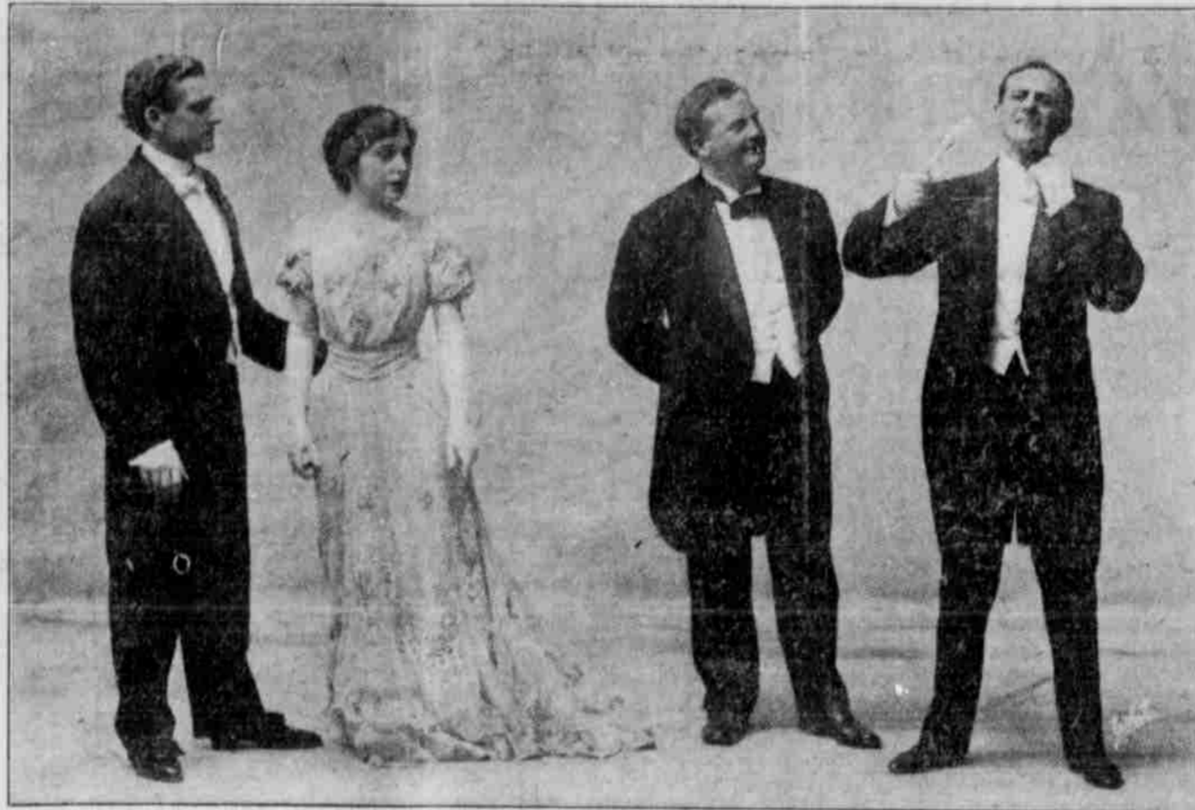
Scene from the great American play "The Man of the Hour," which will be presented at the Keith Theatre Saturday evening, October 16th.

New five room house on west 10th street with electric lights, city water and bath room; all large and lately papered. Nice lawn and trees. $1100 cash will buy it. Temple Real Estate & Insurance Agency.