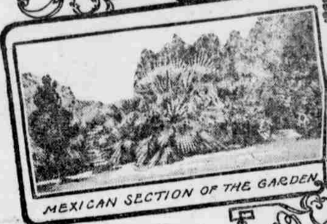
MEXICAN SECTION OF THE GARDEN