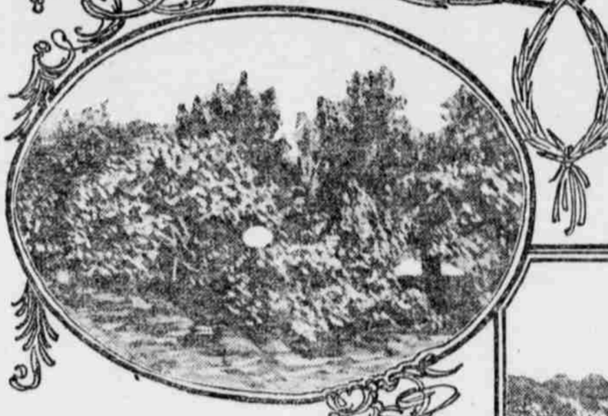
YERBA MATE PARAGUAYAN TEA PLANTS

is cooked and served in many ways. The bark is made into casks and barrels. As the tree sometimes has a diameter of more than a meter, one length of bark serves for a cask.