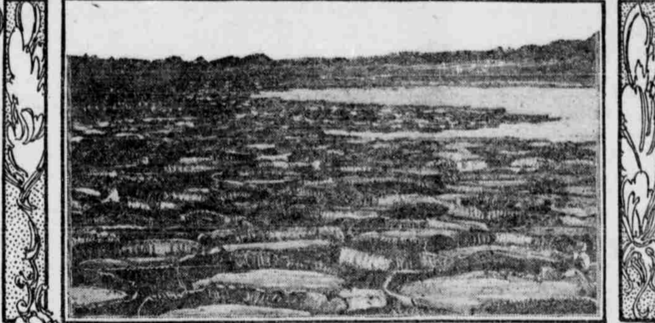
LILIES ON THE UPPER PARAGUAY

The naraecatia, from one of the northern provinces, attains great size and is of unusual service to the people. The pith is edible and