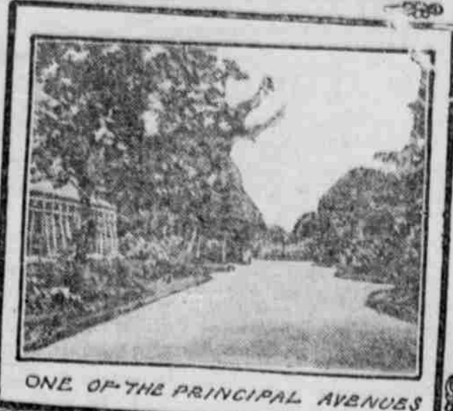
ONE OF THE PRINCIPAL AVENUES

D RIVING out the beautiful avenue of Santa Fe, that practically begins at the Plaza San Martin, and after a due western extension of some 500 yards, bends to the northwest and follows roughly the course of the La Plata for a distance of three miles (40 squares), the entrance to the Botanical garden of Buenos Aires is reached. Beyond this lies the Zoological garden, and still farther on the far-famed Park of Palermo. From both of these the Botanical garden is distinct in spirit and style. It is the embodiment of a refined and artistic taste, a really marvelous blending of the beautiful and the useful.