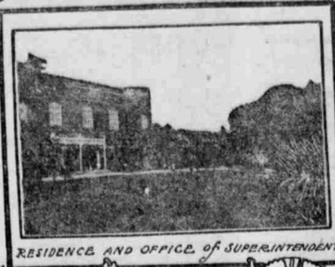
RESIDENCE AND OFFICE OF SUPERINTENDENT