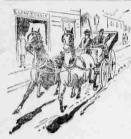
A Spanking Good Team

is at your command whenever you tell us you want it. This livery stable is the Peace in and for Lincoln county, prepared to supply instantly any kind Nebraska, issued an Order of Attachof a rig you require. While in your service it is as much yours as if you owned it. The difference is that you pay only for the time you use it, and not for the time it is standing in the stable. That beats private ownership