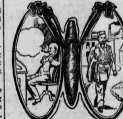
A Treat for all Classes who Smoke.