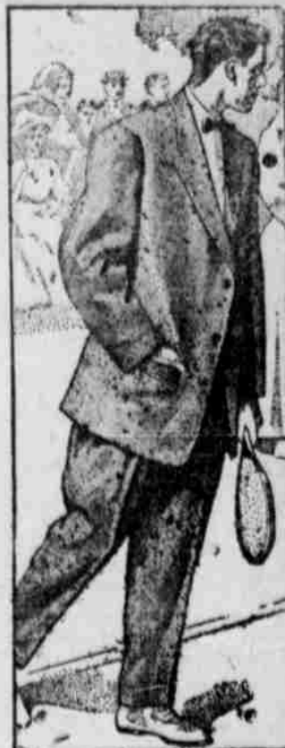
Copyright 1909 The House of Kuppenheimer Chicago

These Suits are right up to our usual high standard and they show every style kink that is now on.