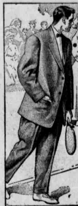
Copyright 1909 The House of Korpenbush Chicago

WEINGAND & McDONALD GOOD CLOTHES MERCHANTS