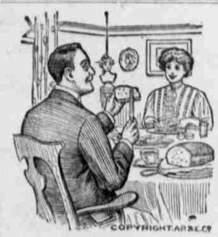
THOSE WHO EAT

See our spring display of genuine Alligator Hand Bags; direct from Florida. Dixon, The Jeweler.