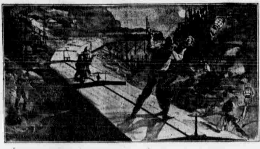
Scene from "The Montana Limited," to be presented at the Opera House next Saturday evening, August 8th.