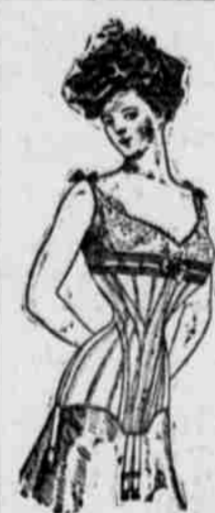
Model No. 1027

¶ No matter what you are in the habit of paying for your corsets, you ought to get acquainted with the