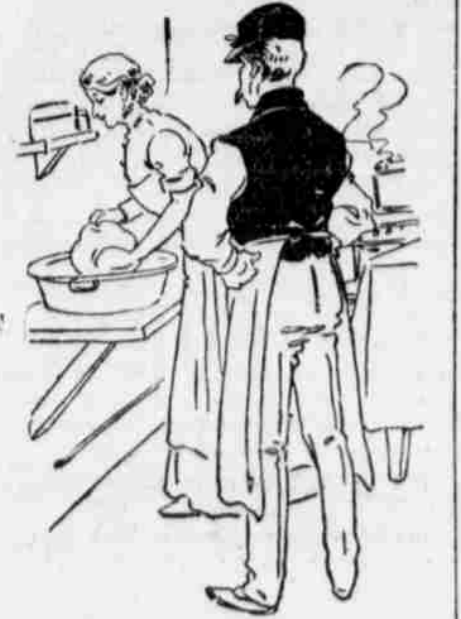
"What a prize I've won!"