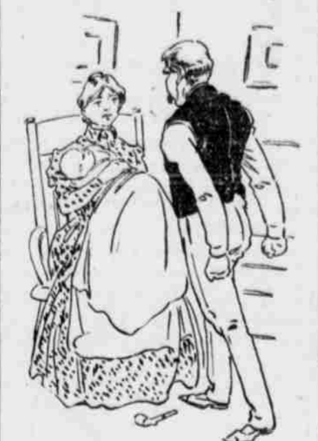
"What! You say that!"

next year. They unimproved. John's business affairs went wrong. It was the year of panic, and collections were difficult to make. Instinct prevented him from groaning in the market place, hence he brought his groans home and discharged them in an avalanche at his wife.