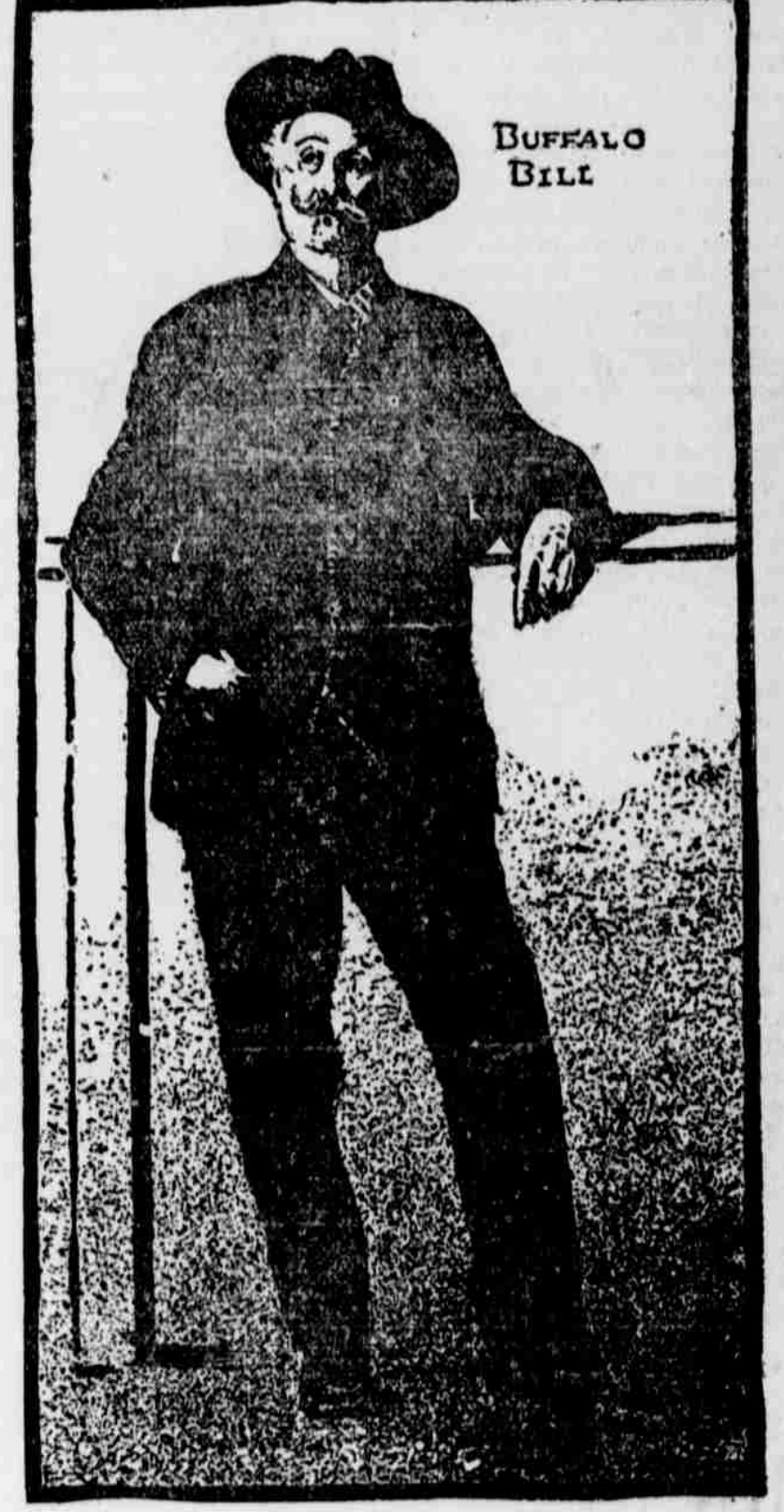
COL. CODY AS HE APPEARS TODAY.

Odd Oklahoma Justice. If one wants to find an extraordinary brand of justice he must go to Oklahoma or some other region known in general parlance as the bounding west. At Alva a man was arrested for stealing two hogs, which he hauled to Waukomis and sold for $20.50. The law defines grand larceny as the stealing of something of more value than $20, and petty larceny as the stealing of something of less value than this sum. The question in the hog case was whether it was grand or petty larceny. The lawyer for the prisoner argued that while the hogs had been sold for more than $20, the prisoner was entitled to a credit of $1 for hauling them to market, which would reduce their value to less than $20 and