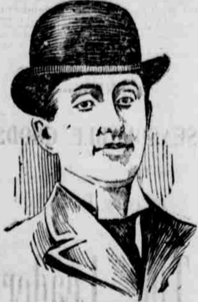
PRINCE EUI WHA.