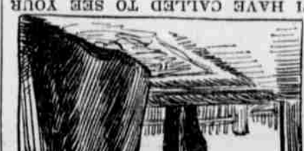
I HAVE CALLED TO SEE YOU.