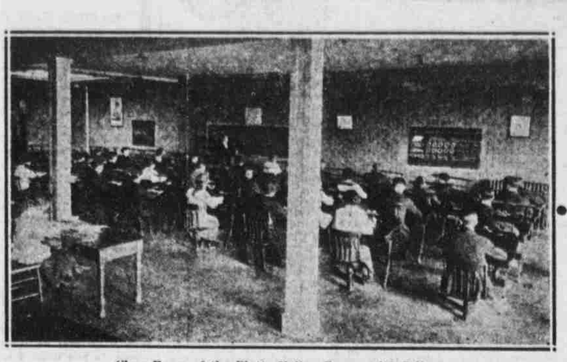
Class Room of the Platte Valley Commercial College,