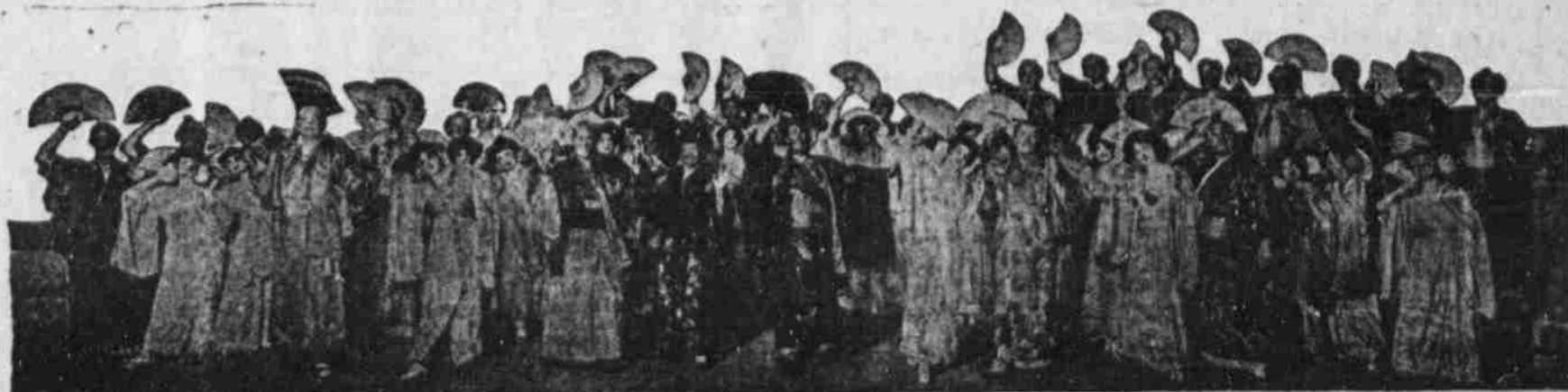
FINALE, ACT I, "THE MIKADO"

Seats Now at Holsten's Drug Store. Lower Floor $2.00, Balcony $1.50