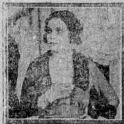
NORMA TALMADGE in "BY RIGHT OF PURCHASE" SELECTED PICTURES