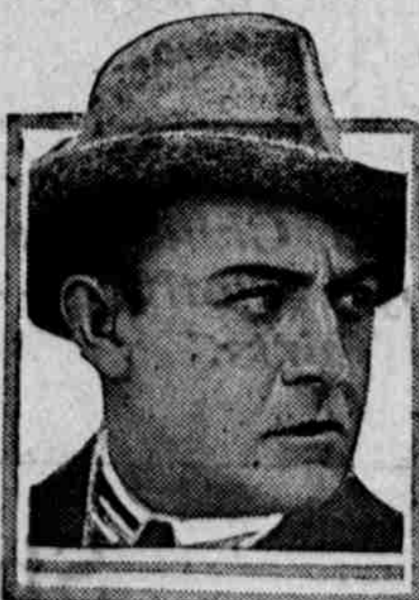
H. E. HERBERT MAURICE TOURNEUR'S "The White Heather" Paramount-Artcraft Special

By special arrangement the undersea scenes in "The White Heather" were produced by the use of the Williamson Submarine Tube and patented inventions, the only means by which such undersea scenes are made possible.