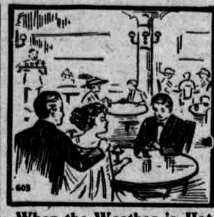
When the Weather is Hot

More likely than not Your thoughts will turn TO COOLNESS! When such is the case